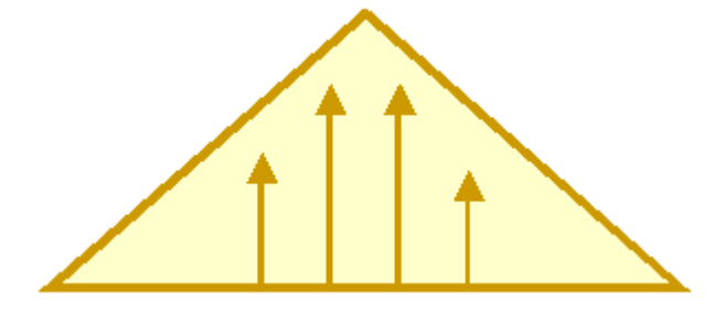
Unlike the Corporate structures of today . . .

The top people in Network Marketing know that their success is in direct proportion to their ability to help others rise to the top with them!